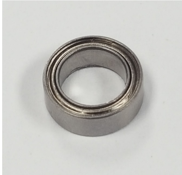
Figure 1. Ball Bearing